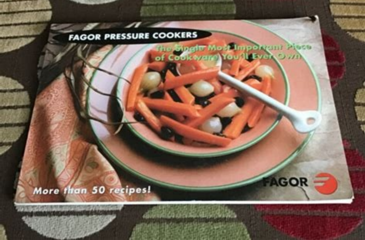
Fagor duo pressure cooker parts australia. Fagor duo pressure cooker manual.